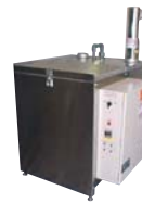
Model SE-1 Evaporator