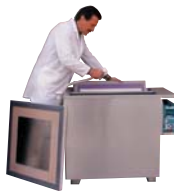
Model 1500 Stencil Cleaner