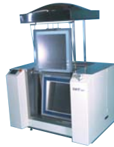
Model 6000 Stencil Cleaner