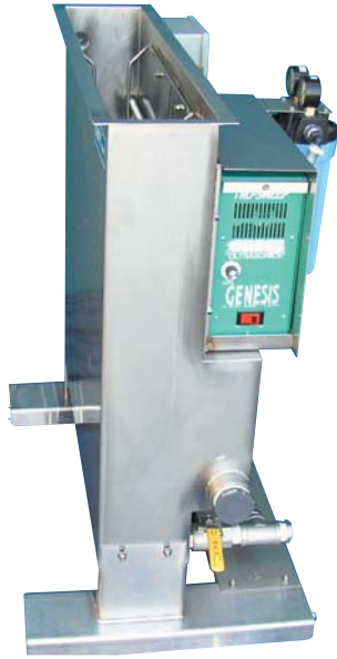
Shown with optional filtration and generator rack